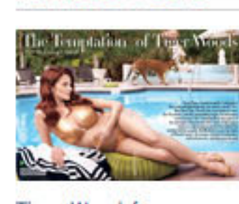
Tiger Woods's Inconvenient Women, Part Two