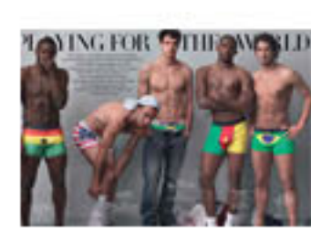
The World Cup's Stars Wear Their Flags—And Little Else