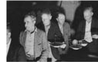
Fun with Capitalism: Match the Executive's Salary to News About His Company's Layoffs!