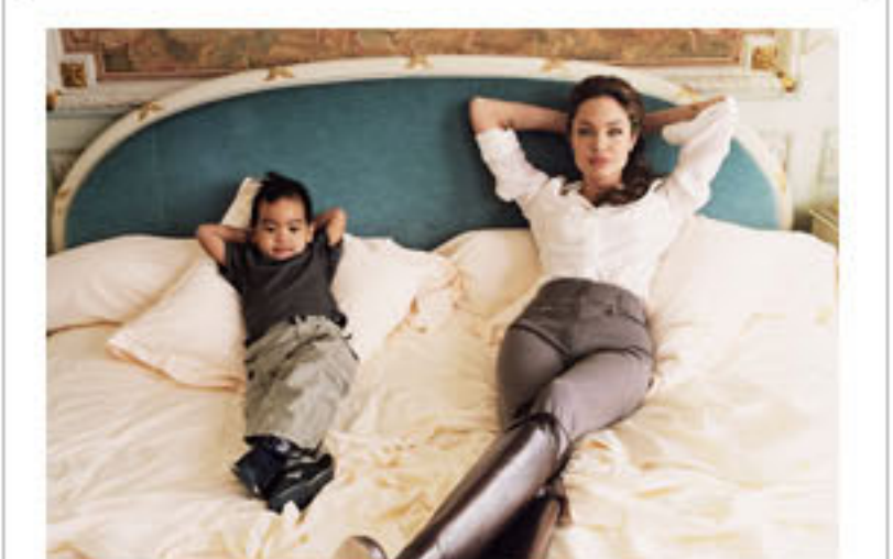
Oscar Moms! For Mother's Day, VF.com presents a gallery of Academy Award-winning mothers and their awe-inspiring offspring.