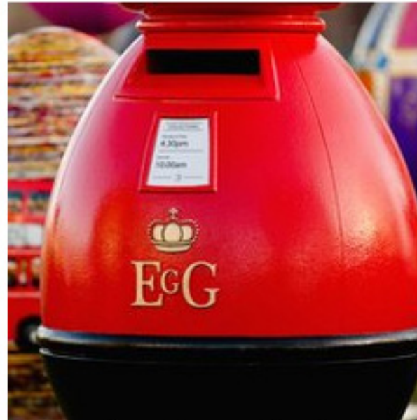
The Egg Letter Box on Carnaby Street has been reported missing

The Big Egg Hunt is due to end in April.